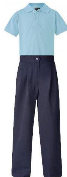
Winter Uniform + Jacket